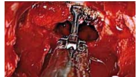
Fig. 3: bipolar coagulation of small vessels at the dural edges with Calvian endo-pen® (REF 700950)

any difficulties. No complications attributable to the use of these bipolar forceps occurred during surgery. No complications occurred post-operatively. The general handling of the Calvian endo-