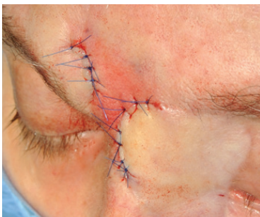
Fig 3: Reconstruction of the large tissue defect with a forehead flap; image acquired after pedicle division.