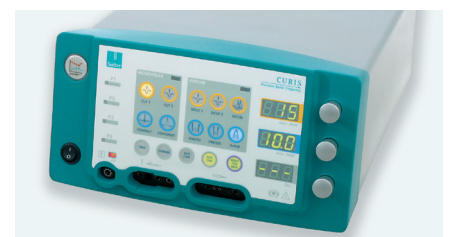
Fig. 6: CURIS® RF unit (Sutter, Germany)

Conclusion: In our opinion, radiofrequency surgery is an ideal method for the treatment of rhinophyma. The most important benefit is represented by the feature of hemostasis, comparable to hot techniques such as electrocautery and