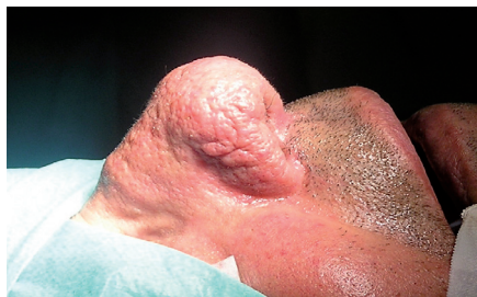
Fig. 2: Patient with rhinophyma

Introduction: Representing the most significant clinical expression of acne rosacea, rhinophyma is characterized by the progressive thickening of skin of the lower third of the nose and the growth of typically hypertrophic irregular skin nodules, which are often aesthetically disabling. To date a number of surgical techniques have been employed in the management of rhinophyma, such as cold dissection with a traditional scalpel, electrocautery and laser-assisted surgery. Cold dissection generally causes major intraoperative bleeding due to rich local vascularization.