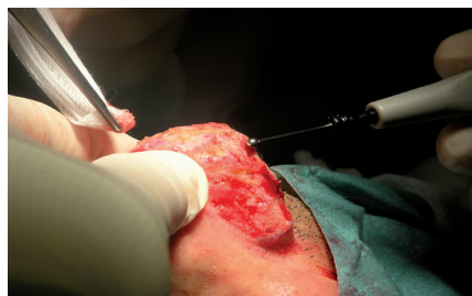
Fig. 4: Final hemostasis obtained by means of a ball shaped electrode

Superficial skin layers have been carefully resected and have produced a thickened uniformity comparable to normal skin around the lesion. A deep layer of skin was carefully preserved to avoid exposing underlying cartilage. During radiofrequency-assisted dissection the bleeding was negligible, and perfect hemostasis was easily obtained by means of the CURIS® radiofrequency generator using monopolar coagulation in CONTACT mode in a range of 20 to 24 watts together with a ball shaped electrode (REF: 360817).