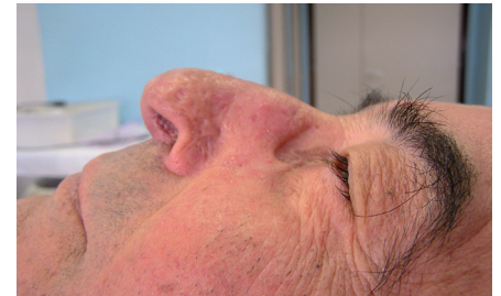
Fig. 5: Patient two months postoperatively

Once re-epithelization was completed, the aesthetic result was judged to be optimal, and the patient was fully satisfied.