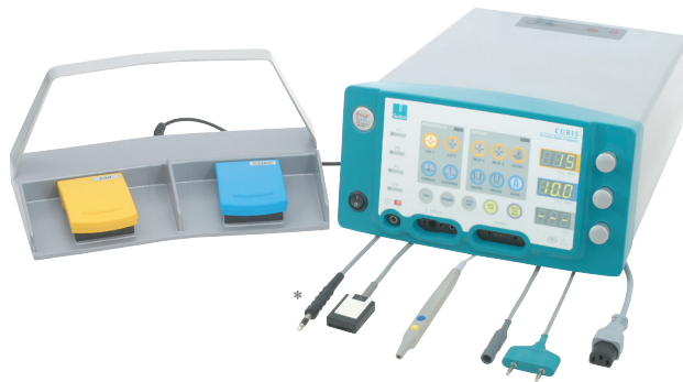
870010 – CURIS® basic set with single-use patient plates