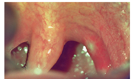
Fig. 5: Retracted pillar one week post-operatively

um-term treatment of habitual snoring. In particular as an addition to multi-level surgery it may be indicated and justified. Free nasal airflow is a precondition. A long uvula should always be shortened.