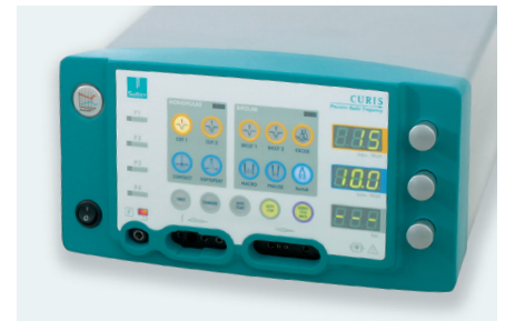
Fig. 4: CURIS® RF unit (Sutter, Germany)

Results and Conclusion: All patients reported a reduction of the snoring volume or intensity. Sixteen patients felt a relief in the throat and reported better oral respiration eight days after the first session. Enlargement of the palatopharyngeal space could be observed (Fig. 5). During the first week after the intervention a generally mild oedema and manageable odynophagia were observed. Only the partial resection of the uvula caused transient difficulties in swallowing for the patient. The preliminary results suggest that the surgical method presented here is effective and well tolerated for short and medi-