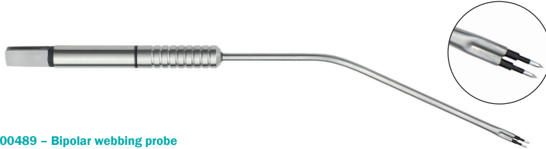
700489 – Bipolar webbing probe