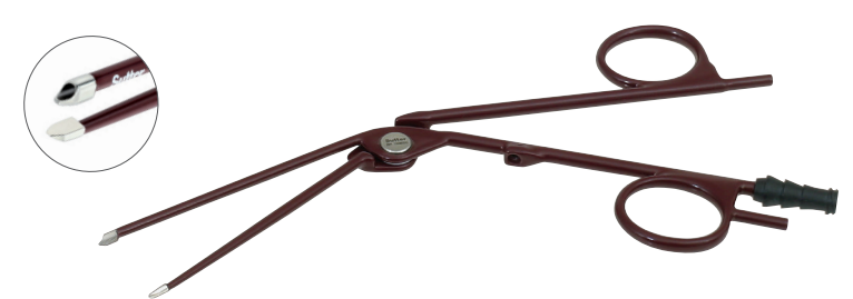
Fig. 1: To-BiTE™ non-stick, bipolar tonsillectomy clamp (70 09 60SG)

One hundred and eighty adult male patients complaining of recurrent tonsillitis were enrolled in the study. The participants were randomly assigned to one of the following techniques: cold steel CLST (n=30), electrocautery ELCTR (n=30), Sutter To-BiTE<sup>TM</sup> bipolar clamp and radiofrequency SRF (n=30), Plasmacision PLCS (n=30), Coblation CBL (n=30), and thermal Welding THRWL (n=30). The SRF group had the least operative time. Histopathologically, necrosis was least in CBL while vascular proliferation was least in SRF. Radiofrequency techniques seem to cause less postoperative pain, have lower blood loss, and lower tissue reactions.