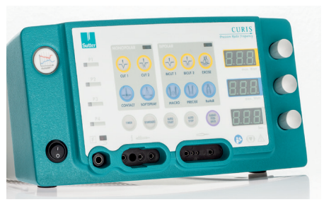
Fig. 2: CURIS® 4 MHz radiofrequency generator.

Operative time for the SRF group was the lowest at three to 20 minutes (average 10.4 \pm 4.28 min.) THRWL had the longest OR time ranging from 17-28 minutes (average 22.66 \pm 4.36 min.) (p<0.00001). We did not use extra cautery for SRF and for six cases of CBL, but needed bipolar cautery for all the other techniques (p<0.00001). The easiest technique to apply was SRF while the most difficult procedure was PLCS. The other applied techniques were found to be similar (p<0.00001). Postoperative pain on the 1<sup>st</sup> day