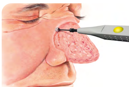
Fig. 4: Sculpting of nasal contours