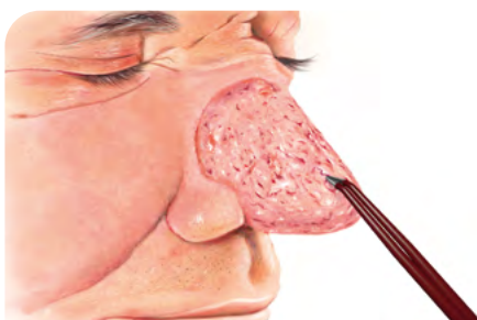
Fig. 3: Bipolar coagulation of remaining bleeders