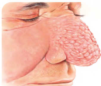
Fig. 1: Prior to rhinophyma resection