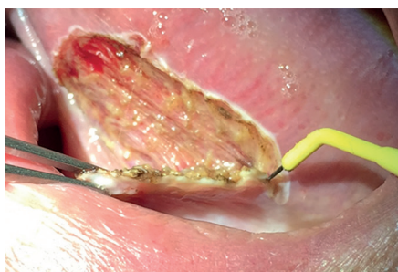
Fig. 2: Radiofrequency-assisted resection of an oral leukoplakia of the bottom of the tongue.

Material and Methods: All patients with oral or oropharyngeal tumors were included. Excluded were patients who had undergone preliminary radiation of the head and neck; who had a tumor of a size that would have required further reconstruction or an extended surgical approach. An excision was performed with the 4 MHz CURIS® Radiofrequency Generator (REF 360100-01, Sutter Medizintechnik GmbH, Freiburg, Germany) using a monopolar RF needle (REF 360342, Fig. 1 and 2). Radiofrequency was evaluated with perioperative parameters (bleeding, tissue sticking, coagulation, user friendliness), objective postoperative parameters (wound healing, postoperative complications) and subjective postoperative parameters (visual analogue scale for the assessment of pain, impairment of food intake, impairment of speech). The surgical specimen was evaluated with regard to the completeness of the resection, width of coagulation margin and the quality of the resection margin.