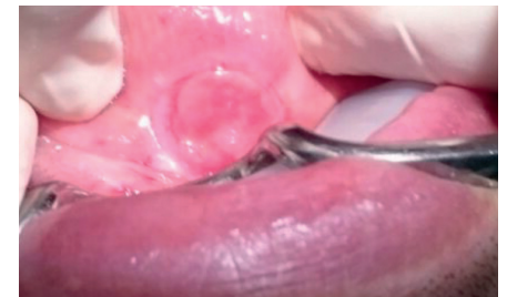
Fig. 5: Site of resection 14 days after surgery.

We observed no lingual muscle stimulation with 4 MHz RF which is an advantage especially for patients under local anesthesia.