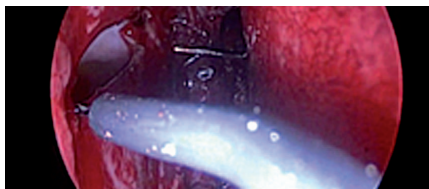
Fig. 2: Lacrimotomy with RF generator CURIS®

lacrimal sac was exposed. Under endoscopic visualization the lower lacrimal point was identified with a Bowmann electrode inserted through the nasal cavity. The lacrimal sac partition was dissected with an ARROWtip™ electrode (REF 36 03 65 WL 65 mm, Sutter Medizintechnik GmbH, Freiburg/Germany) and the RF generator CURIS® in monopolar mode (Fig. 2; settings: CUT 1 in cutting mode; CONTACT mode for coagulation; power range 18 to 24 watts).