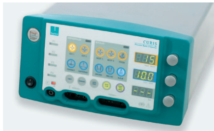
Fig. 1: CURIS® RF unit (Sutter, Germany)

Introduction: Complications from incisions after traditional surgery in dacryocystitis range from 1% to 25% and average at 13%. They are often due to non-efficient techniques, scar formation, and the continuation of the pathological development in the nasal cavity and sinuses [1,2,3,5,7,8]. Endoscopic DCR is time-saving and less traumatic. It prevents scarring while tissue is spared, and contributes to the formation of the desired stoma. This generally reduces the risk of relapses and provides a stable outcome. Studies have shown that the effectiveness of DCR is usually higher than 90% [10, 11]. The latest findings in ENT show that radiofrequency has become a method of choice for endonasal DCR with a long-term success rate of more than 98% [12]. We have chosen a novel approach using the 4 MHz radiofrequency RF Generator CURIS® (Sutter Medizintechnik GmbH, Freiburg/Germany) (Fig. 1) for performing DCR.