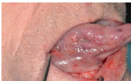
Fig. 2: Ulcerous lesion of the right side of the tongue.

Methods: A 75-year old male patient suffered from a painful ulcerous lesion at the lateral side of the tongue. Lesional biopsy revealed a keratinizing squamous cell carcinoma (Fig. 2).