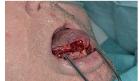
Fig. 6: Operative site after total tumor extirpation.

effective tool for dissecting tumors under local anesthesia achieving a good combination of radicality and hemostasis.