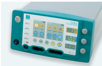
Fig. 3: CURIS® 4 MHz RF unit (Sutter, Germany)

Due to severe comorbidity, the patient underwent hemiglossectomy under local anesthesia. The excision was performed with the CURIS® 4 MHz radiofrequency generator (Sutter Medizintechnik GmbH, Freiburg/Germany) using an ARROWtip™ monopolar microdissection electrode (REF 36 03 25).