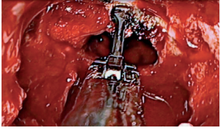
Fig. 3: bipolar coagulation of small vessels at the dural edges with Calvian endo-pen® (REF 70 09 50)

any difficulties. No complications attributable to the use of these bipolar forceps occurred during surgery. No complications occurred post-operatively. The general handling of the Calvian endo-pen<sup>®</sup> bipolar forceps is very comfortable and coagulation at the tip of the forceps very effective (Fig. 3). The hand-grips are