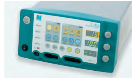
Fig. 1: CURIS® 4 MHz RF unit (Sutter, Germany)

There is no significant difference regarding intraoperative blood loss although the CO 2 laser tends to lead to stronger intraoperative bleeding requiring more frequent hemostasis. Postoperative pain, use of medica-