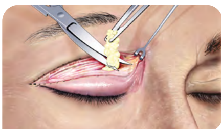
Fig. 4: Removal of prolapsed fatty tissue after exposing the orbital septum