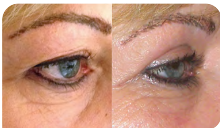
Fig. 5: Before and after an upper eyelid surgery