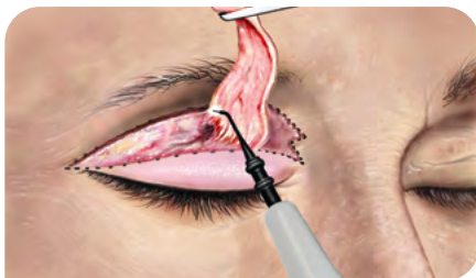
Fig. 2: Skin incision and excision of the skin area using the ARROWtip™ monopolar microdissection electrode