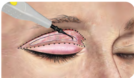
Fig. 3: Excision of a small strip of orbicularis oculi muscle