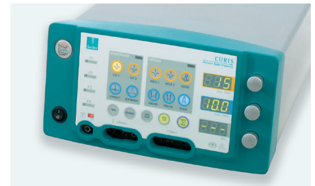
Fig. 2: CURIS® 4 MHz RF unit (Sutter, Germany)

Furthermore the ARROWtip™ monopolar microdissection electrodes offer excellent visualization with the high-intensity operating light of the microscope, simplicity of