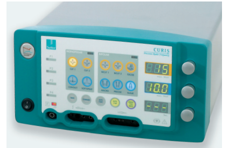
Fig. 4: CURIS® RF unit (Sutter, Germany)

removed and the capsule between the pillars remains, children still suffer pain after surgery. A greater thermal lesion of the surrounding tissue due to greater heat created by laser could explain this feature. Our results showed less pain with radiofrequency compared to laser surgery. Comparisons of radiofrequency vs. monopolar electrosurgical procedures have shown similar results [4].