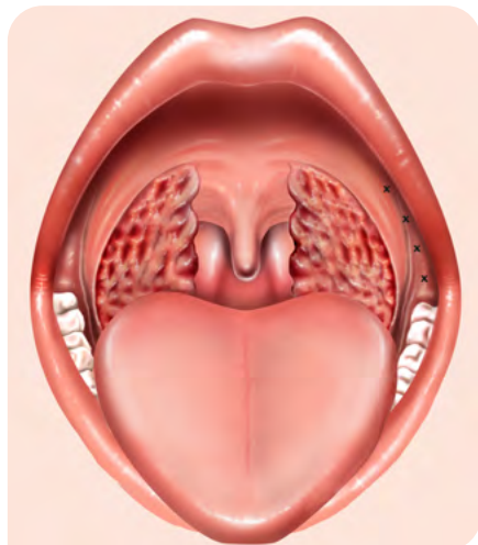
Fig. 1: Puncture sites for infiltration of local anesthetic