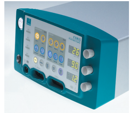
Fig. 3: CURIS® radiofrequency unit (Sutter/Germany)

Functional results have been studied. In chordectomies, the voice quality was evaluated by a single speech therapist using the GRBAS method, domain G (Grade of dysphonia: R=Roughness, B=Breathiness, A=Asthenia and S=Strain). Severity of dysphonia was scored as 1=slight, 2=moderate or 3=severe. The quality of voice was similar in a group of people where the GRBAS results were compared with results obtained from patients who had a similar operation with the CO2 laser. No post-operative complications were observed with either method. In case of extensive chordectomies, patients developed glottic incompetence in both groups. With micro-dissection electrodes none of the patients developed a granuloma. Oncological results with ARROWtip™ instruments on T1 glottic tumors were excellent and similar to those of