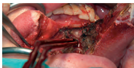
Fig. 2: Radiofrequency assisted transoral hemiglossectomy performed. Use of monopolar micro-dissection needle for cutting and SuperGliss® non-stick bipolar forceps (REF 78 21 81SG) for coagulating.

wall of the trachea. The procedure was quick and there was no bleeding. No carbonization of tissues was observed. Afterwards, a selective neck dissection including I, II, III and IV neck levels, was executed. Radiofrequency-assisted dissection produced clean and sharp results, even close to the internal jugular vein and accessory nerve. "CUT1" monopolar mode on the unit was found to be an optimal setting providing a precise microdissection, at an intensity of 20-35 watts depending on tissue impedance. Lateral damage appeared to be very low, compared to conventional electrosurgery. For coagulating, the SuperGliss® non-stick bipolar forceps produced very efficient and comfortable results because the tips remained clean and perfectly working for the whole time. Finally, the transoral hemiglossectomy was performed, using the CURIS® 4 MHz radiofrequency unit setting the power to 20