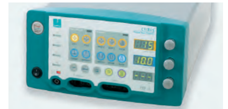
Fig. 4: CURIS® 4 MHz RF unit (Sutter, Germany)

suture was used to close the tongue wound. Postoperatively no complication was observed and wound healing occurred without delays. The patient complained of moderate pain in his mouth, no pain on the neck. Absolutely no edema was observed in the tongue. The patient started to eat two days postoperatively. The tracheostomy was closed five days postoperatively. The suture in the neck wound was removed eight days postoperatively.