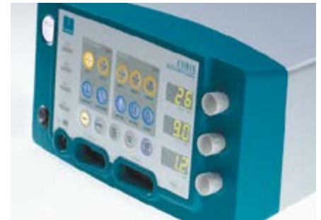
Figure 3: CURIS® radiofrequency unit (Sutter Medizintechnik GmbH, Germany)

Discussion: Our results indicate that the surgical RaVoR™ treatment of NANIPER patients can enlarge the airways and improve respiratory obstruction. Postoperatively the results last for as long as two years. This is confirmed by improved CSA and reduced NR values during a two year study period. The ciliary beat was improved for a period of two years, as clearly shown by MCT scores. The findings indicate that there is no damage to the mucosa resulting from the treatment. The clinical results do not differ in female and male patients. Furthermore, we did not observe any side ef-