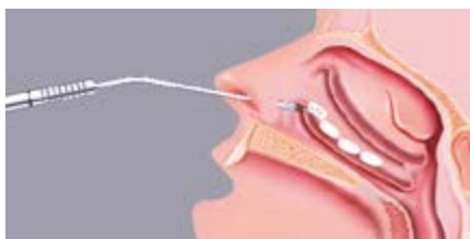
Figure 2: Schematic view of the puncture sites for the RaVoR™ treatment of hypertrophic turbinates.

The RaVoR™ procedure was always performed under local anesthesia, but without infiltration. One strip of cotton soaked with lidocaine spray was placed in each nasal passage for ten minutes. The patients were in supine position with the head and shoulders raised up and supported. The reusable bipolar turbinate probe "Binner" (REF 70 04 62) and the generators BM-780 II (level 2, i.e. 6 watts, total energy ≤ 54 joules) or CURIS® (10 watts, RaVoR™ mode, AutoStop, total energy ≤ 100 Joule) were used to create 4 to 5 lesions (Figure 2). To reach the posterior part of the nasal cavity a lateralization of the turbinate was performed. Afterwards the patients were sent home and advised to use saline solution for 2 to 3 weeks. Nasal tamponades were never required.