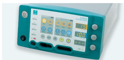
Fig. 2: CURIS® 4 MHz RF unit (Sutter, Germany)

Methods: A prospective, non-randomized, unblinded clinical study was conducted with 53 patients: 23 male and 30 female (ranging from 18 to 65 years averaging at age 35.7). The subjective symptoms of nasal obstruction were measured by a standard 10 cm visual analog scale (VAS). The measurement was repeated 10 minutes after application of a topical nasal decongestant (0.1% xylometazoline hydrochloride nasal spray) in both nostrils. Subjective symptoms were evaluated at baseline and after 1, 3 and 6 months postoperatively. Nasal resistance was measured on each side by active anterior rhinomanometry (Rhino-stream by Interacoustics, Assens/Denmark) at baseline and after 1, 3 and 6 months postoperatively. Radiofrequency ablation (CURIS® 4 MHz radiofrequency generator by Sutter Medizintechnik, Freiburg/Germany) was performed on all patients by the same surgeon (3rd author) in an outpatient procedure. One strip of cotton soaked with topical lidocaine 4% was applied to both nasal cavities for 10 minutes. Both turbinates