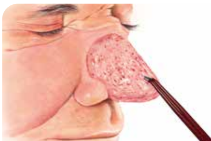
Fig. 3: Bipolar coagulation of remaining bleeders