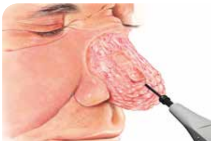
Fig. 2: During rhinophyma resection