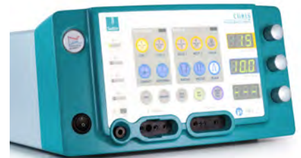
Fig. 4: CURIS® 4 MHz radiofrequency generator

Discussion: The high precision of the RF thin monopolar needle allows detailed treatment of small vessels by minimizing longitudinal injury of the epithelial and reticular dermis in patients with facial telangiectasias. The risk of scarring is very low if the treatment is performed cautiously with the appropriate setting. Temporary hyperemia and gentle crusting in the diameter of the applied needle may occur if the epithelium has been injured. Re-epithelialization is secured by stem cells, that are typically not affected by RF. 6 However, one should inform the patient about