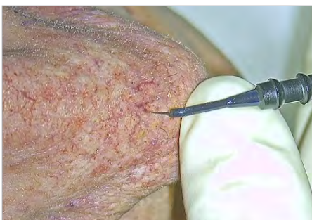
Fig. 3: RF treatment of telangiectasia of the nose

Please turn over the page for detailed information on the Sutter products.