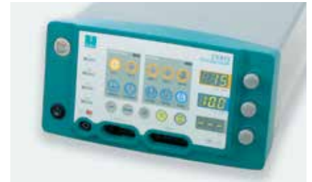
Fig. 1: CURIS® RF unit (Sutter, Germany)

There is no significant difference regarding intraoperative blood loss although the CO 2 laser tends to lead to stronger intraoperative bleeding requiring more frequent hemostasis. Postoperative pain, use of medica-