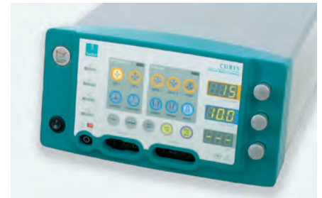
Fig. 5: CURIS® 4 MHz RF unit (Sutter, Germany)

Discussion: In the last 7-8 years the author has exclusively used the radiofrequency method and has observed clear clinical advantages for both technique and for the patients. Compared with the conventional scalpel method there is less intra-operative bleeding, the dissection is definitely easier to perform and more precise, resulting in rapid and uncomplicated healing. In comparison with laser surgery the author has observed less lateral heat spread, as confirmed in the clinical literature (4) and much less undesired tissue alteration resulting in more moderate oedema and hyperaemia with quickly disappearing cicatrices post-operatively. No or only minor