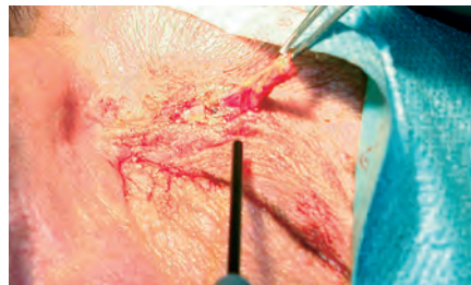
Fig. 3: Resection with monopolar fine needle electrode

eyelid is infiltrated, superficially applying 1% lidocaine (devoid of adrenaline or epinephrine). An active monopolar needle is used to outline the lesion, including a 2-3 mm border of unaffected skin. The inferior border is then elevated with the help of short fine forceps and the fine monopolar needle electrode is used to dissect the underlying tissue of the xanthelasma plaque, enabling its complete resection. After careful bipolar hemostasis and control of the operation site (microscopic evaluation maybe be