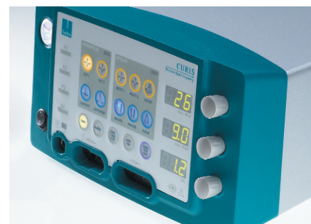
Figure 3: CURIS® radiofrequency unit (Sutter Medizintechnik GmbH, Freiburg, Germany)

Discussion: Our results indicate that the surgical RaVoR™ treatment of NANIPER patients can enlarge the airways and improve respiratory obstruction. Postoperatively the results last for as long as two years. This is confirmed by improved CSA and reduced NR values during a two year study period. The ciliary beat was improved for a period of two years, as clearly shown by MCT scores. The findings indicate that there is no damage to the mucosa resulting from the treatment. The clinical results do not differ in female and male patients. Furthermore, we did not observe any side ef-