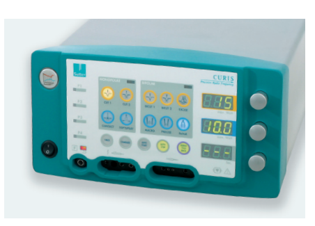
Fig. 4: CURIS® RF unit (Sutter, Germany)

Results and Conclusion: All patients reported a reduction of the snoring volume or intensity. Sixteen patients felt a relief in the throat and reported better oral respiration eight days after the first session. Enlargement of the palatopharyngeal space could be observed (Fig. 5). During the first week after the intervention a generally mild oedema and manageable odynophagia were observed. Only the partial resection of the uvula caused transient difficulties in swallowing for the patient. The preliminary results suggest that the surgical method presented here is effective and well tolerated for short and medi-