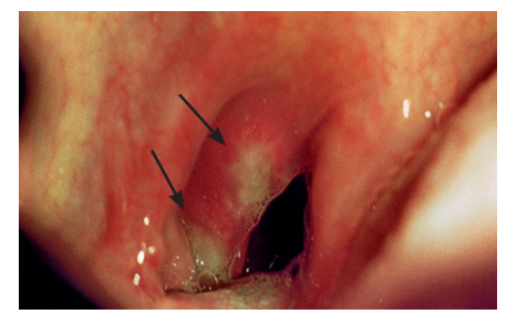
Fig. 2: Pillar immediately after RF treatment

Surgical technique: Local anaesthetic spray (tetracaine) is administered while the patient is sitting. Four (2 to 3 ml) injections of xylocaine 1 % with adrenaline 1:200.000 are placed along the anterior edge of the velum. For treatment each posterior pillar is divided in two or, if wider, three parts where the probe is inserted (Fig. 2). Thin and lax pillars tend to resist needle pressure. It may take a few attempts to insert the probe. To ensure correct placement, visual verification is advisable. Each site is treated for about 4 to 5 seconds with 9 watts in the RaVoR^{\mbox{\tiny TM}} mode of the CURIS^{\mbox{\tiny B}} (Sutter, Germany) (BM-780 II: precise, power "2"). A certain discolouring or minor necrosis of the tissue may be expected and will contribute to the desired effect.