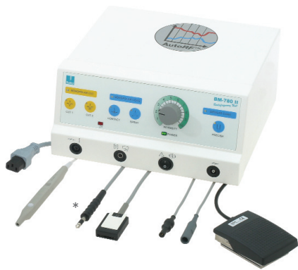
860010 – BM-780 II basic Set with single-use patient plates