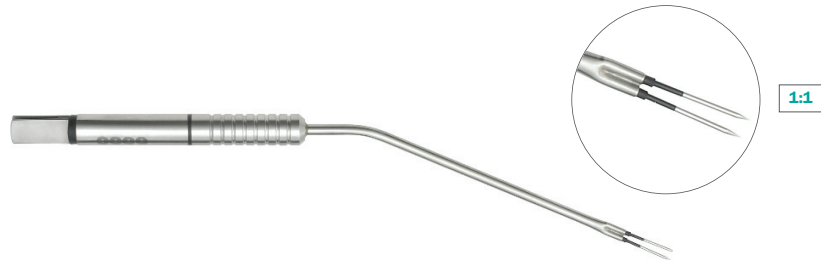
700462 – Bipolar needle electrode "Binner"