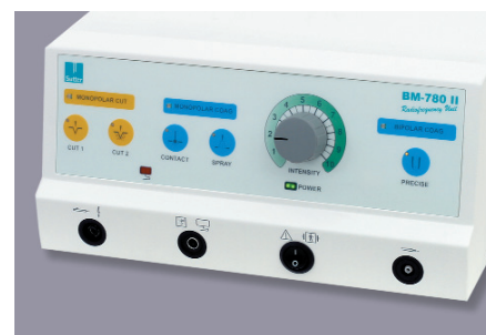
Fig. 3: Sutter BM-780 II radiofrequency unit

Under General Anesthesia: The procedure is performed in the same fashion as under local anesthesia, except for the numbing and infiltration of the nasal cavity and the inferior turbinates with lidocaine for obvious reasons.