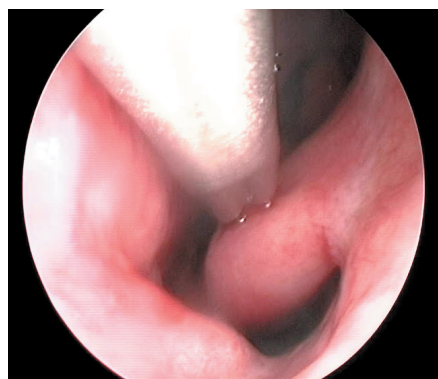
Fig. 1: Endoscopic view of the probe fully inserted

Preparation of the Patient (under local anesthesia): 1. For ten minutes the turbinates are packed in cottonoids soaked with lidocaine spray to achieve numbing of the nasal cavities. 2. Under direct visualization, using a nasal speculum and a headlight, injection of 0.5 to 1.0 cc of 2% lidocaine into each inferior nasal turbinate is made using a gauge 29 or 30 spinal needle. 3. After administration of the anesthetic the patient may leave the treatment room for 30 minutes, but should remain under supervision.