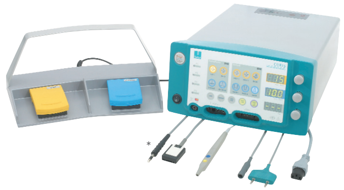
870010 – CURIS® basic set with single-use patient plates