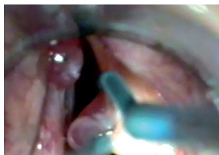
Fig. 2: Excision of benign laryngeal tumor with ARROWtip™ electrode