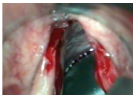
Fig. 3: Surgical site immediately post-operatively