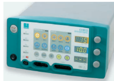
Fig. 4: CURIS® RF unit (Sutter, Germany)

Results and Discussion: Histopathology showed denaturation of collagen at the stroma level, yet similar in all cases, regardless of the type of surgery used. Post-operatively, epithelial damage was small. Hemostasis was considered sufficient, intraoperatively and after surgery. Other than a few cases of mild edema, we saw no post-operative complications. The group with RF had a faster recovery. These patients could be discharged on the same day or within 2 days after surgery. Six of the patients operated on with the CO2 laser needed 3 days of hospitalization, and other five laser-patients required systemic anti-inflammatory and antibiotics treatment. Their post-operative discomfort remained unchanged. The average post-operative pain levels were different in both groups. Patients recorded their pain two times a day over a 5-day period after surgery on a visual analogue scale (VAS) and through numeric rating (NSR). The results have confirmed that the pain level in the laser group is higher and that the tolerance for RF is better. RF patients experienced less discomfort and re-