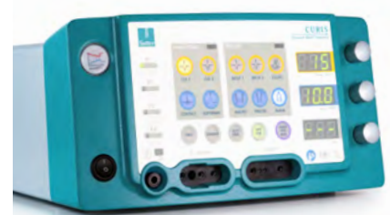
Fig. 4: CURIS® 4 MHz radiofrequency generator

Conventional electrocautery machines work at frequencies between 350 and 500 kHz and cause greater lateral thermal damage than the CURIS® that cuts with a tissuegentle power output of 4 MHz. Bridenstine [2] even speaks of a thermal damage margin of 75 μm when using radiofrequency for skin cuts, but fails to indicate the depth of the skin incision. Pollack [3] reports faster initial reepithelialization with cold steel cuts, but also shows similar results at the end of the healing period. Hambley [4] established that even conventional electrosurgery creates less epidermal destruction than the CO 2 laser. Our findings and those of others [5] show the RF cut to be superior to cuts with conventional