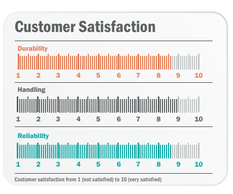
Fig. 2: Customer satisfaction from 1 (not satisfied) to 10 (very satisfied)

Besides the quality of a product it is also the economic aspect that has an impact on customer satisfaction. For more insight into this aspect, the participants were asked to compare the costs of the CURIS<sup>®</sup> 4 MHz radiofrequency generator with other technologies. About three fourths of the participants stated that the CURIS<sup>®</sup> 4 MHz radiofrequency generator was less expensive than laser technology (CO2 laser and diode laser) as well as plasma technology. In addition, many of the participants stated that they found working with the CURIS<sup>®</sup> 4 MHz radiofrequency generator to be more time-saving than other technologies.