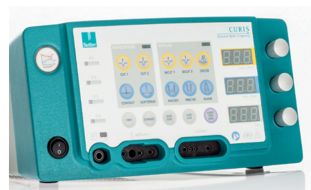
Fig. 2: CURIS® 4 MHz radiofrequency generator.

Operative time for the SRF group was the lowest at three to 20 minutes (average 10.4 ± 4.28 min.) THRWL had the longest OR time ranging from 17-28 minutes (average 22.66 ± 4.36 min.) (p<0.00001). We did not use extra cautery for SRF and for six cases of CBL, but needed bipolar cautery for all the other techniques (p<0.00001). The easiest technique to apply was SRF while the most difficult procedure was PLCS. The other applied techniques were found to be similar (p<0.00001). Postoperative pain on the 1 st day