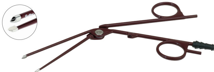
Fig. 1: To-BiTE™ non-stick, bipolar tonsillectomy clamp (70 09 60SG)

One hundred and eighty adult male patients complaining of recurrent tonsillitis were enrolled in the study. The participants were randomly assigned to one of the following techniques: cold steel CLST (n=30), electrocautery ELCTR (n=30), Sutter To-BiTE™ bipolar clamp and radiofrequency SRF (n=30), Plasmacision PLCS (n=30), Coblation CBL (n=30), and thermal Welding THRWL (n=30). The SRF group had the least operative time. Histopathologically, necrosis was least in CBL while vascular proliferation was least in SRF. Radiofrequency techniques seem to cause less postoperative pain, have lower blood loss, and lower tissue reactions.