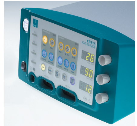
Figure 4: CURIS® radiofrequency unit (Sutter/Germany)

Conventional electrocautery machines work at frequencies between 350 and 500 kHz and cause greater lateral thermal damage than the CURIS® that cuts with a tissue-gentle power output of 4 MHz. Bridenstine [2] even speaks of a thermal damage margin of 75 µm when using radiofrequency for skin cuts, but fails to indicate the depth of the skin incision. Pollack [3] reports faster initial reepithelialization with cold steel cuts, but also shows similar results at the end of the healing period. Hambley [4] established that even conventional electrosurgery creates less epidermal destruction than the CO 2 laser. Our findings and those of others [5] show the RF cut to be superior to cuts with conventional electrosurgery, which operates at lower frequencies.