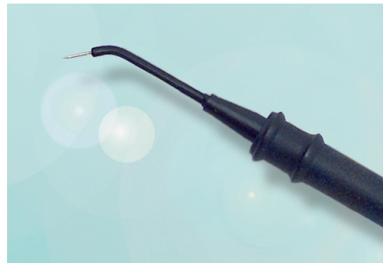
Figure 3: Monopolar ARROWtip electrode, short-angled

Results: Wound healing was uneventful. Histologic examination showed a lateral thermal damage of 150 micrometer caused by the radiofrequency unit CURIS® (Fig. 1). The depth of the incised skin measured over 1.7 mm. On the same specimen a cut was made with a conventional electrosurgical unit (Berchtold Elektrotom 400), operating at 500 kHz, using the same electrode at comparable power. Histopathology showed a necrosis of approx. 286 µ – almost twice the thermal damage that occurred during the use of the CURIS® (Fig. 2).