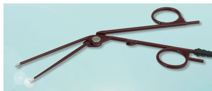
Fig. 3: To-BiTE™ (REF 70 09 60 SG), bipolar clamp

Presentation of a series of bipolar tonsillectomies using radiofrequency: We have been performing bipolar radiofrequency tonsillectomies thanks to the bipolar To-BiTE™ forceps developed with the CURIS® generator, which we have been using personally for several years and which provide ergonomics, comfort and reliability of use. This allows a precise grasp while performing incision and coagulation as well as aspiration, resulting in speed of execution with perfect control over the dissection plan. In our series, we operated on 150 patients between September 2006 and March 2009, all under general anaesthesia and with intubation. We experienced perfect control of peri-operative haemostasis in all cases. In two cases there was minimal unilateral haemorrhaging. The first post operative bleeding occurred on the