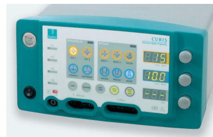
Fig. 4: CURIS® radiofrequency unit (Sutter Medizintechnik GmbH/Germany)

Presentation of a series of bipolar tonsillectomies using radiofrequency: We have been performing bipolar radiofrequency tonsillectomies thanks to the bipolar To-BiTE™ forceps developed with the CURIS® generator, which we have been using personally for several years and which provide ergonomics, comfort and reliability of use. This allows a precise grasp while performing incision and coagulation as well as aspiration, resulting in speed of execution with perfect control over the dissection plan. In our series, we operated on 150 patients between September 2006 and March 2009, all under general anaesthesia and with intubation. We experienced perfect control of peri-operative haemostasis in all cases. In two cases there was minimal unilateral haemorrhaging. The first post operative bleeding occurred on the