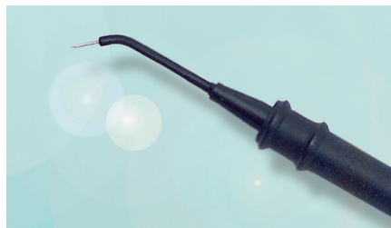
Fig. 3: ARROWtip™ monopolar microdissection electrode, short-angled

Results: Wound healing was uneventful. Histologic examination showed a lateral thermal damage of 150 micrometer caused by the CURIS® 4 MHz radiofrequency generator (Fig. 1). The depth of the incised skin measured over 1.7 mm. On the same specimen a cut was made with a conventional electrosurgical unit (Berchtold Elektrotom 400), operating at 500 kHz, using the same electrode at comparable power. Histopathology showed a necrosis of approx. 286 µ – almost twice the thermal damage that occurred during the use of the CURIS® 4 MHz radiofrequency generator (Fig. 2).