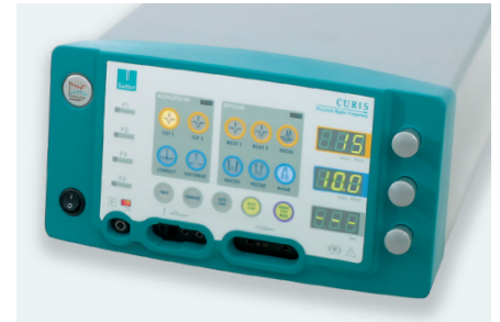
Fig. 4: CURIS® 4 MHz RF unit (Sutter/Germany)

Discussion: In a study on excisions of thin upper eyelid skin, radiofrequency was superior to the CO 2 laser method [1]. For incisions in thicker facial skin such as the forehead, higher power settings are required that will increase lateral thermal damage as a result. Nevertheless, surgery with the CURIS® 4 MHz radiofrequency generator yielded good cosmetic results. Conventional electrocautery machines work at frequencies between 350 and 500 kHz and cause greater lateral thermal damage than the CURIS® that cuts with a tissuegentle power output of 4 MHz. Bridenstine [2] even speaks of a thermal damage margin of 75 µm when using radiofrequency for skin cuts, but fails to indicate the depth of the skin incision. Pollack [3] reports faster initial reepithelialization with cold steel cuts, but also shows similar results at the end of the healing period. Hambley [4] established that even conventional electrosurgery creates less epidermal destruction than