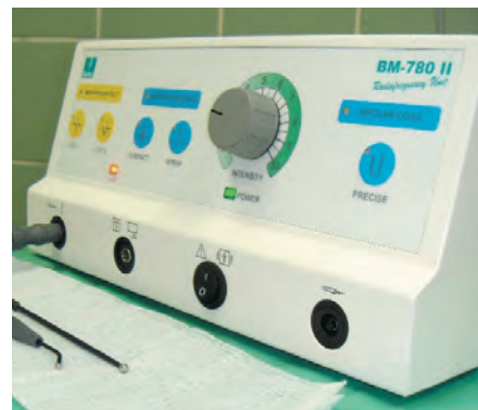
Figure 1: Radiofrequency unit (RF generator) BM-780 II with 2 mm straight and 3 mm angled ball electrodes

Literature: Marinescu A. Innovative bipolar radiofrequency volumic reduction with "ORL-Set" for treatment of habitual snorers. Laryngorhinootologie . 2004; 83:610-616; Folz BJ, Zoll B, Alfke H, Toussaint A, Maier RF, Werner JA. Manifestations of hereditary hemorrhagic telangiectasia in children and adolescents. Eur Arch Otorhinolaryngol . 2006; 263(1): 53-61; Werner JA. Treatment concept for recurrent epistaxis in patients with hereditary hemorrhagic telangiectasia. HNO . 1999; 47(6): 525-527;