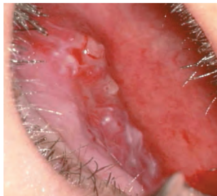
Figure 2: Patient with Rendu-Osler-Weber syndrome, preoperative findings

be reduced by 70 % in the patients treated. Figure 4 shows the results six months post-operatively after radiofrequency coagulation of nasal hereditary haemorrhagic telangiectasia of the nasal mucosa of the anterior septum. The mucosa has healed completely with little scarring underneath.